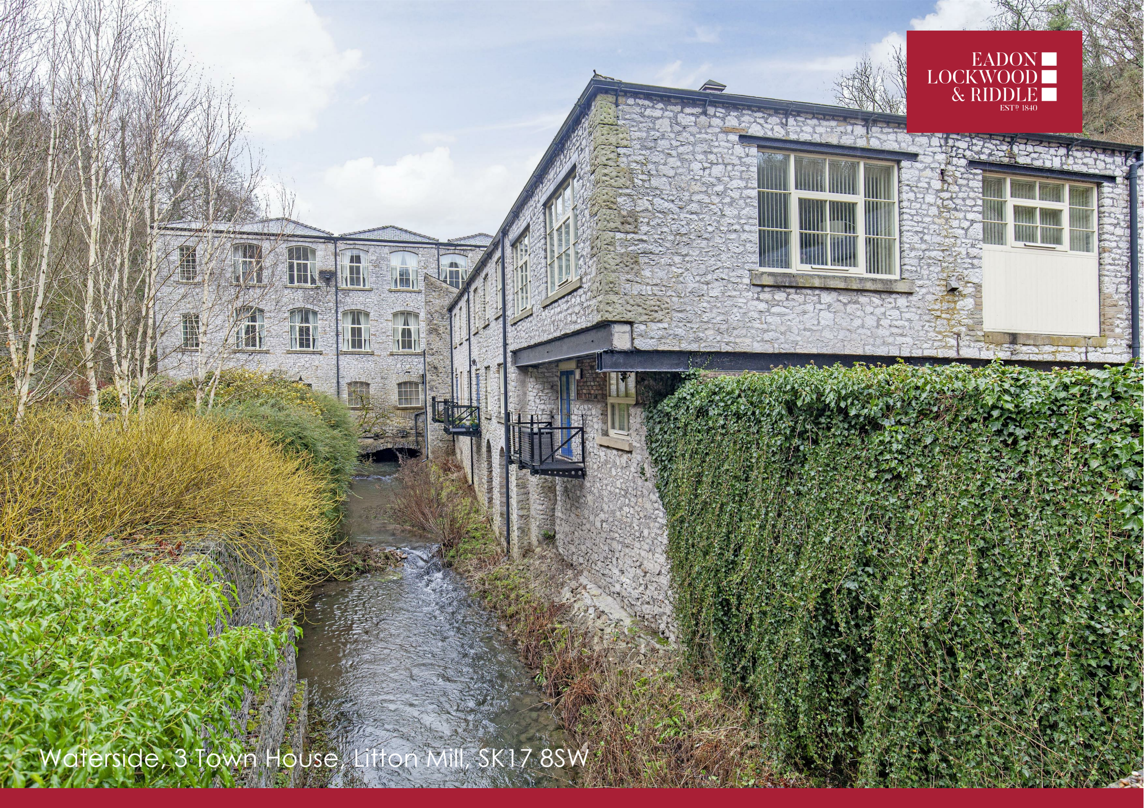
Waterside, 3 Town House, Litton Mill, SK17 8SW