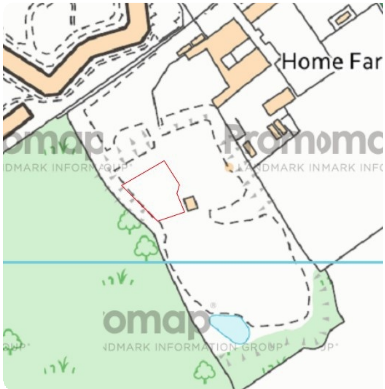
Yard At Home Farm, Oxford Road, Ryton On Dunsmore, Coventry, CV8 3EP