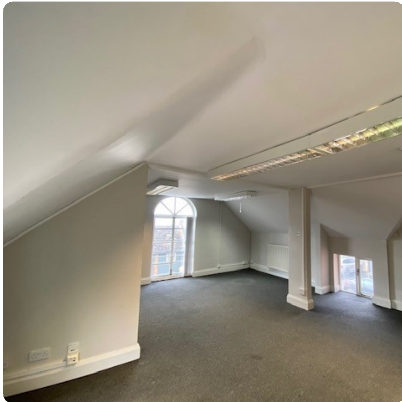
King John's Court , Stratford Upon Avon, Atherstone On Stour, CV37 8NF