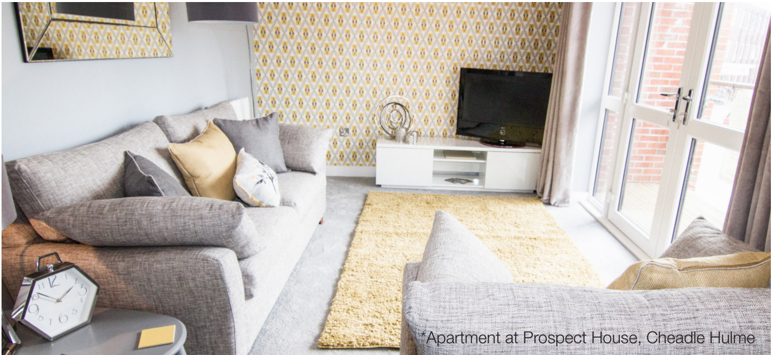
*Apartment at Prospect House, Cheadle Hulme