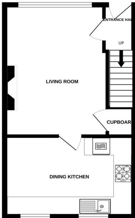
GROUND FLOOR 344 sq.ft. (31.9 sq.m.) approx.