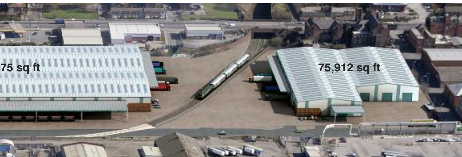
These are indicative layouts to demonstrate a typical development many other options are possible