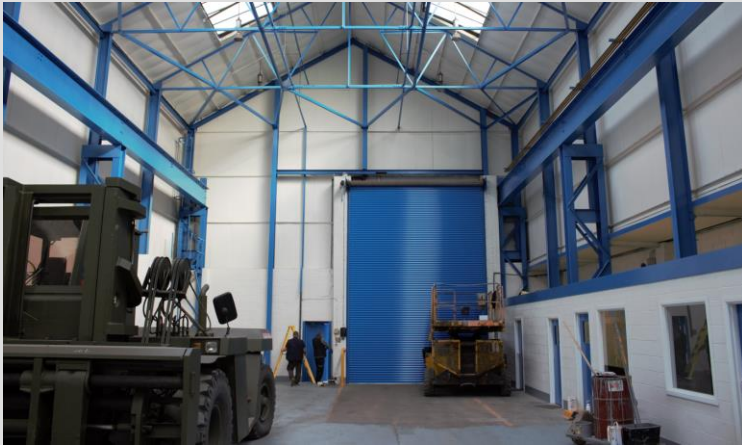
*Please note photography is from March 2014*