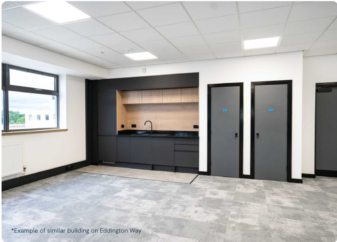
*Example of similar building on Eddington Way