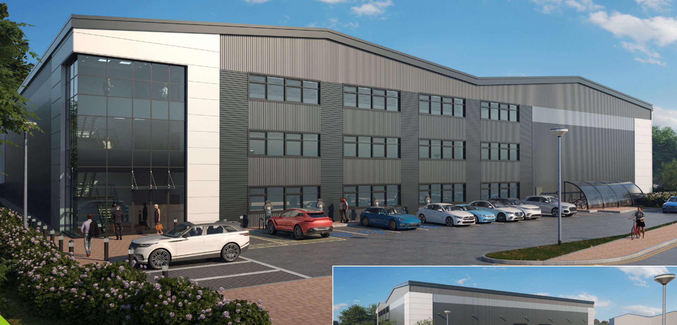
CGI image of the development