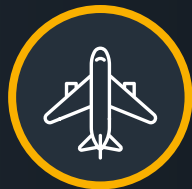
LIVERPOOL JOHN LENNON AIRPORT 28 minutes