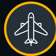
MANCHESTER INTL. AIRPORT 32 minutes