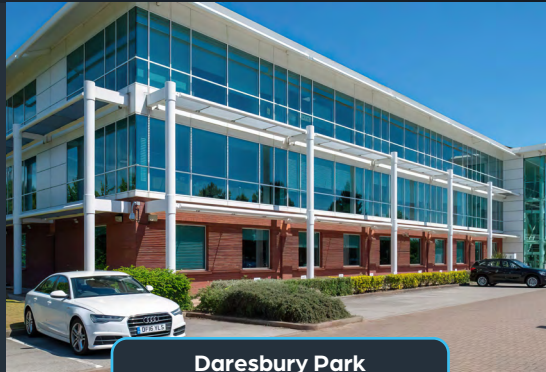
Daresbury Park Daresbury Cheshire J11 M56