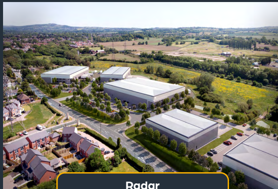
Radar Radway Green Crewe J16 M6