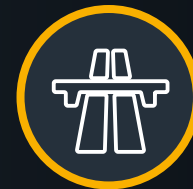
M6/M56 INTERSECTION 21 minutes