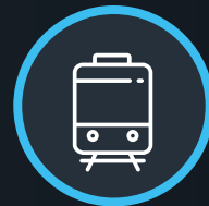
ELLESMERE PORT TRAIN STATION 5 minutes