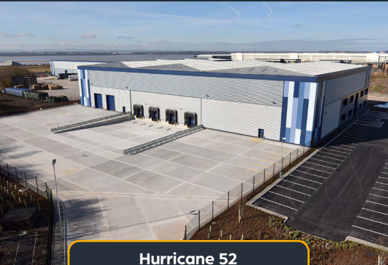
Hurricane 52 Estuary Business Park South Liverpool L24 8RF