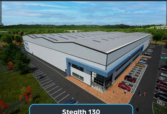
Stealth 130 Welsh Road Northern Gateway Deeside CH5 2RD