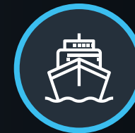
PORT OF LIVERPOOL 37 minutes