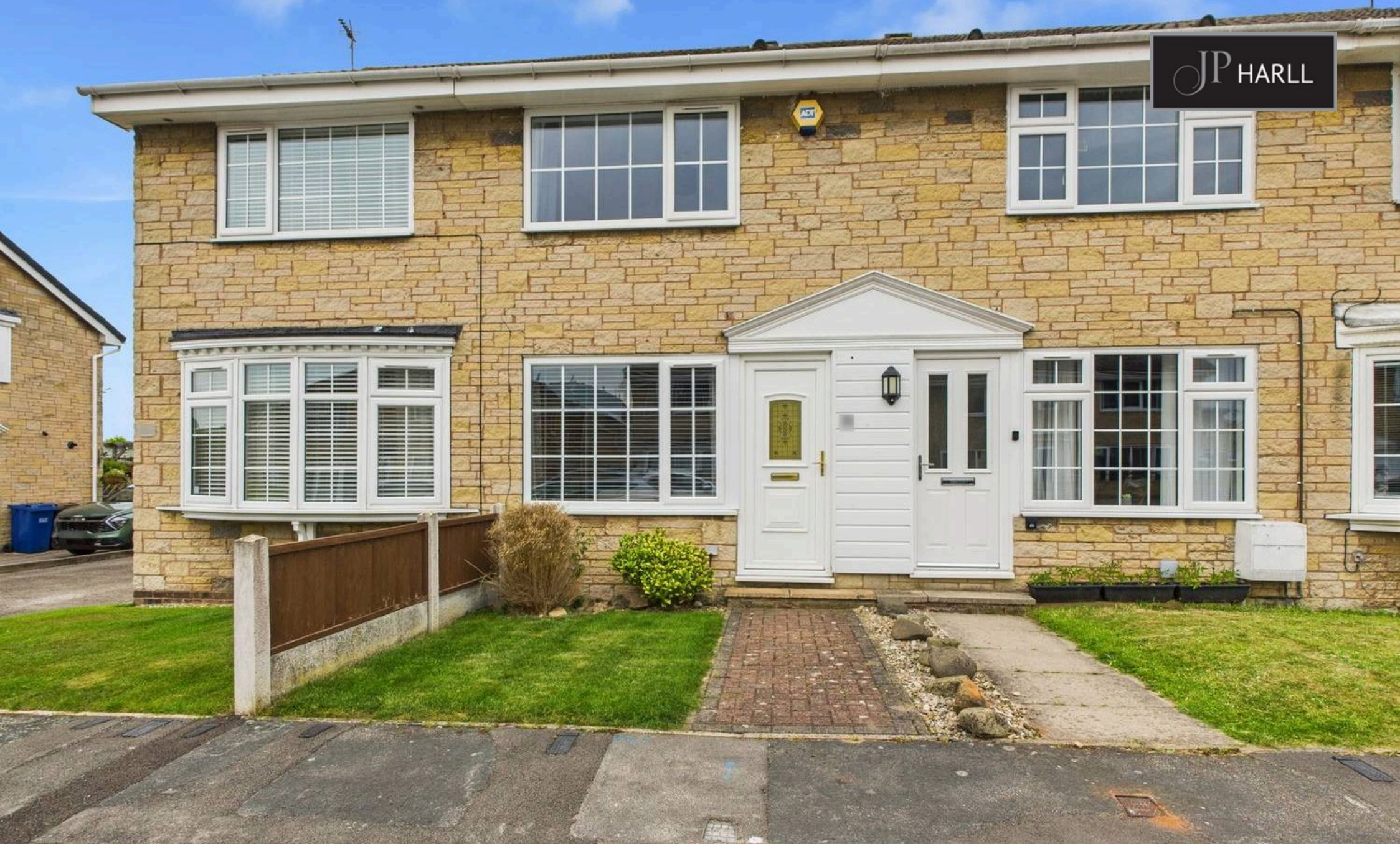
Field Avenue, Thorpe Willoughby, YO8 9PS £175,000