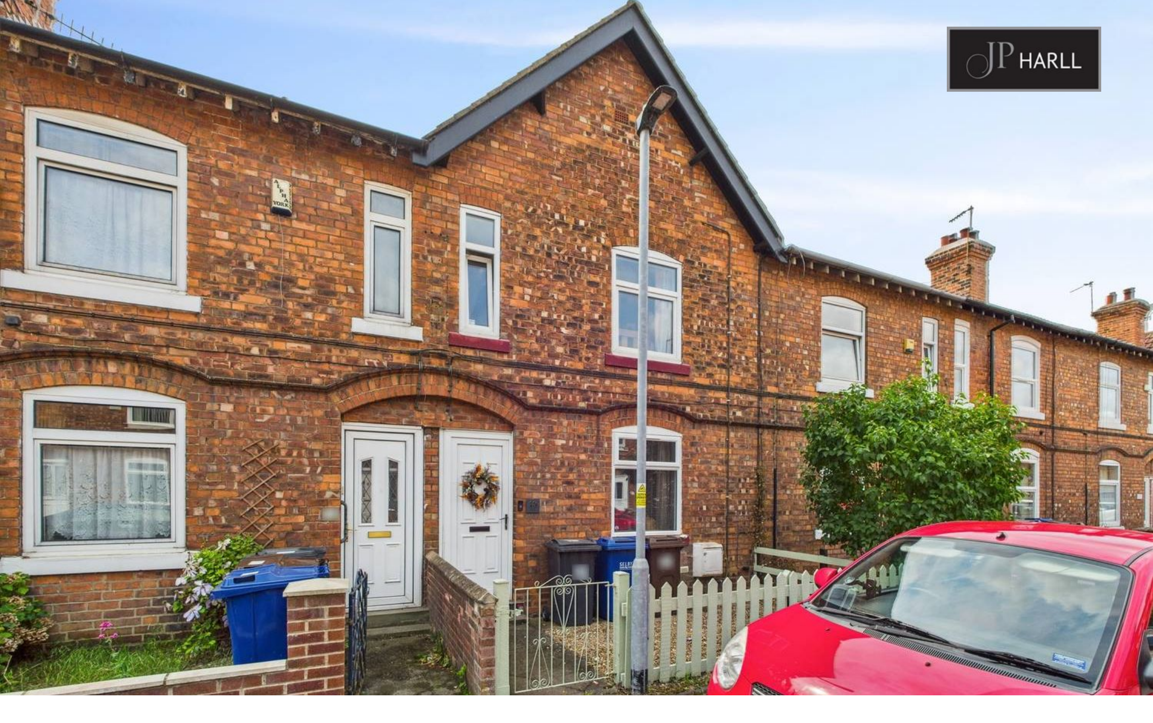
John Street, Selby, YO8 5AJ £170,000