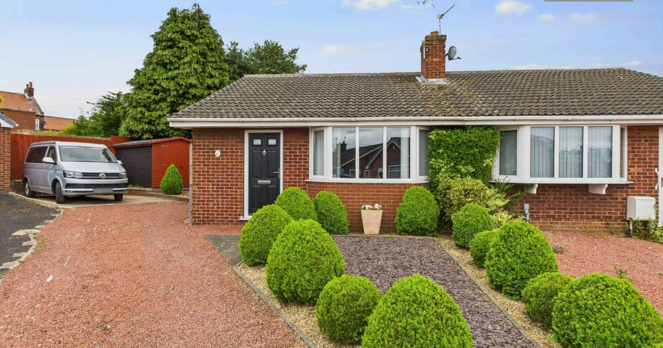
Acorn Close, Barlby £190,000