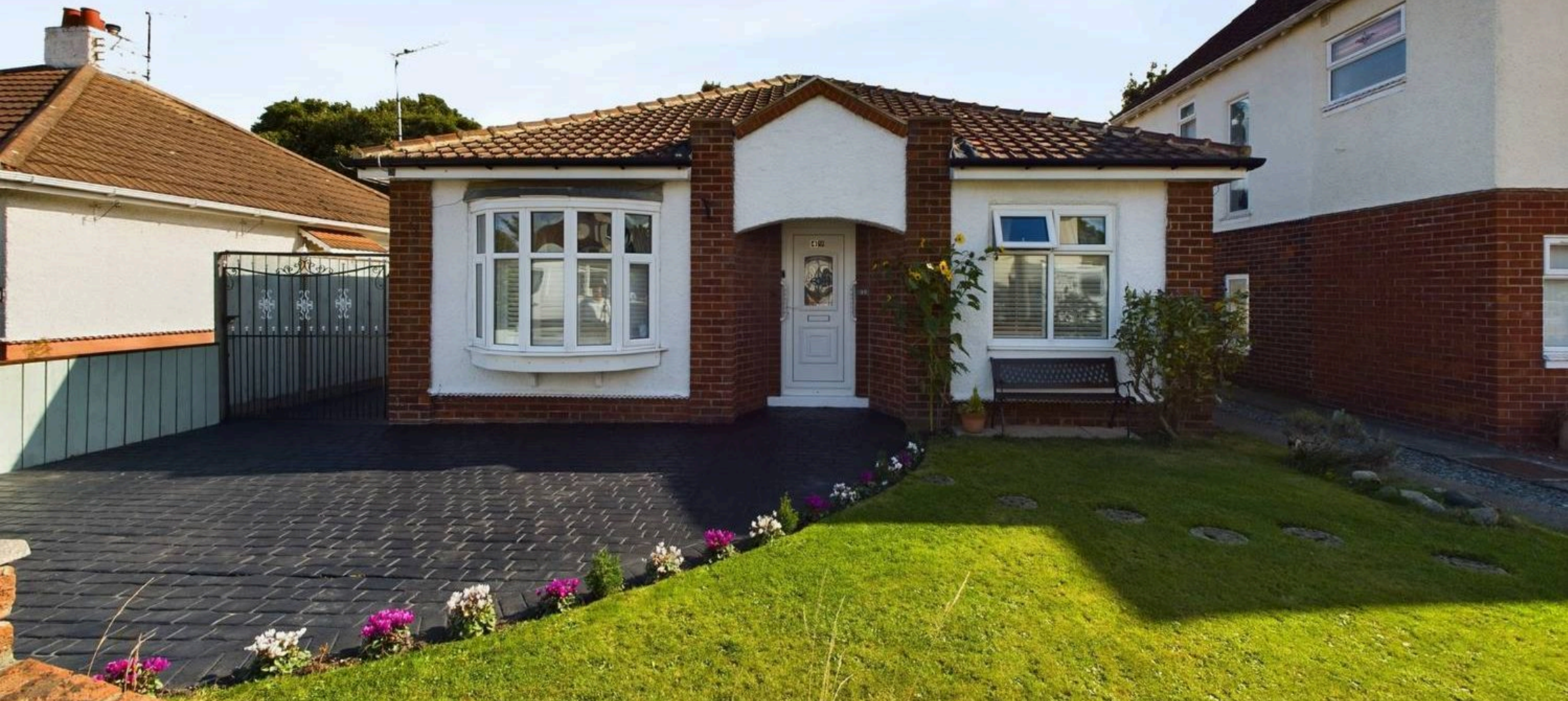
Caledonian Road, Hartlepool, TS25 5LB Offers Over £225,000