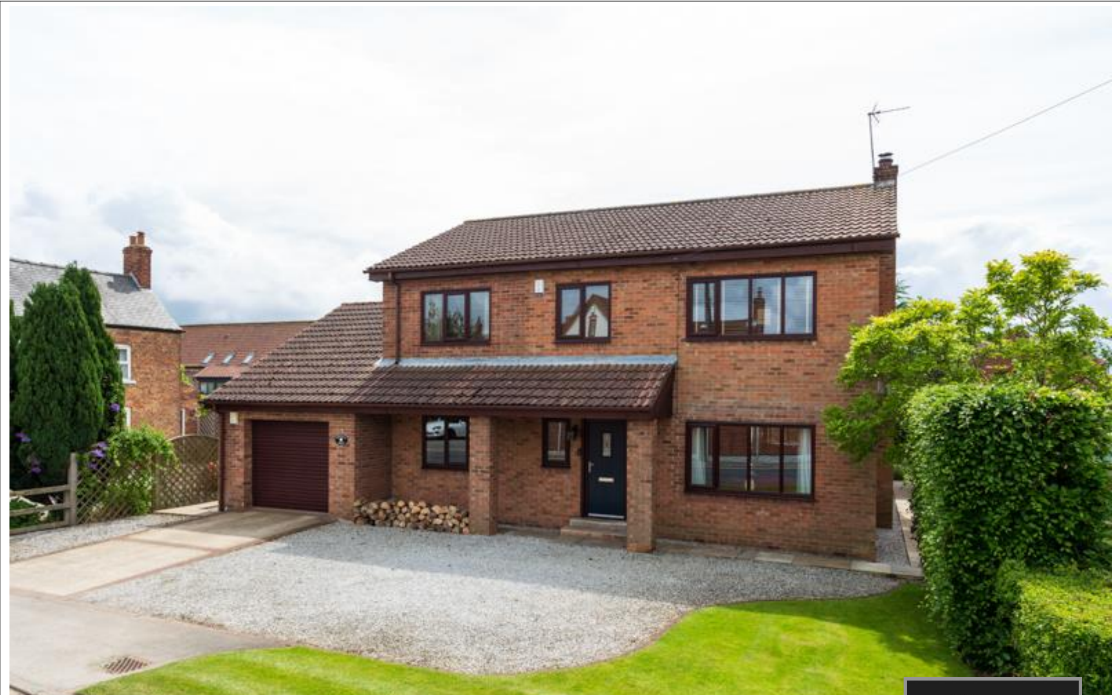
MUIRFIELD HOUSE ASSELBY, DN14 7HE