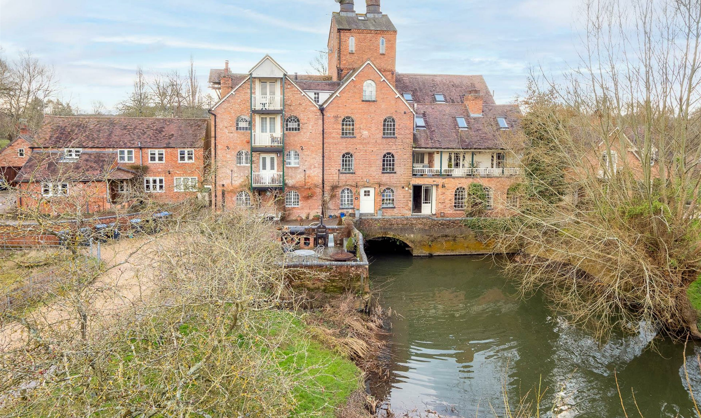
Great Alne Mill , Mill Lane, Great Alne Alcester, B49 6JA