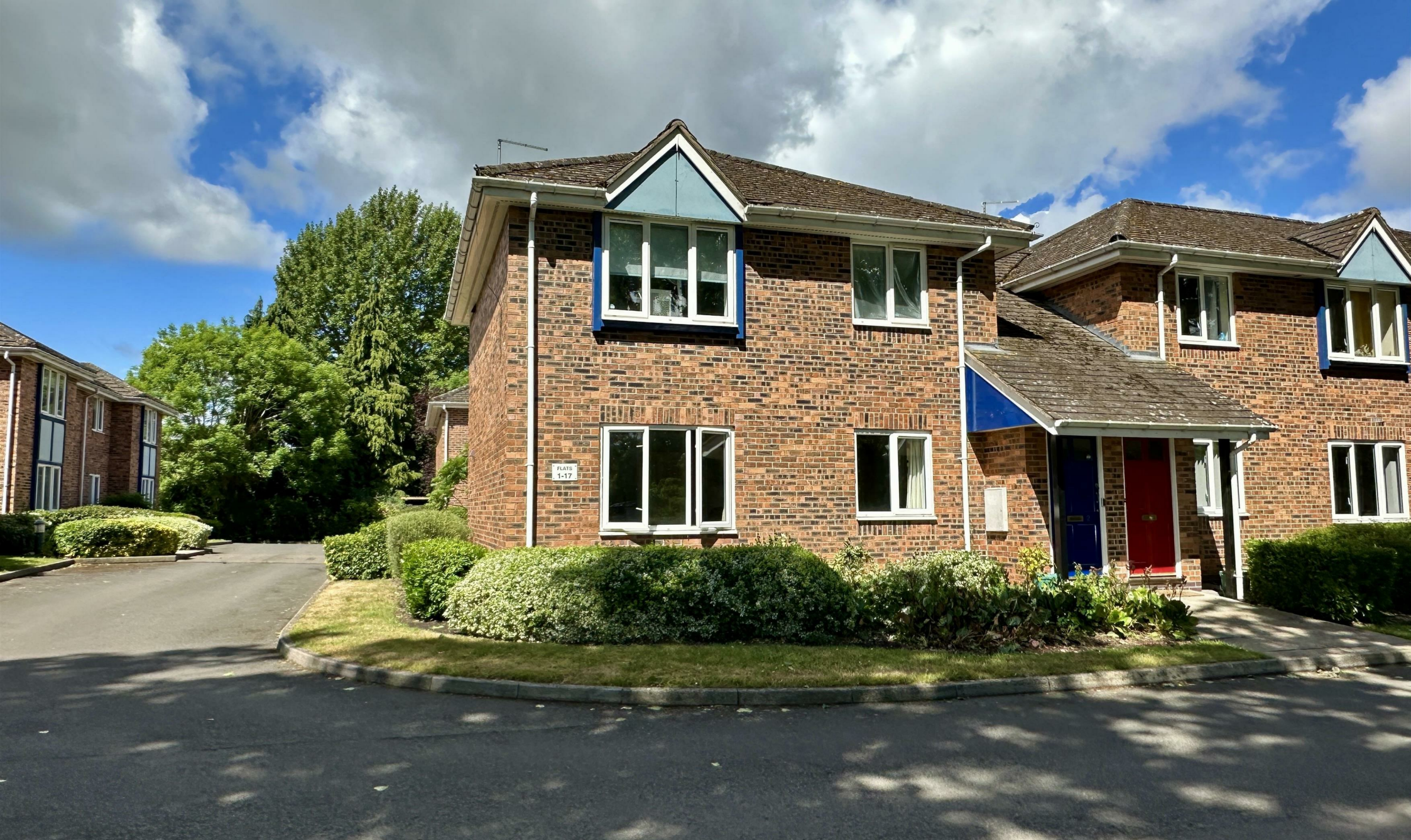
Corinthian Court , Alcester, B49 5AY