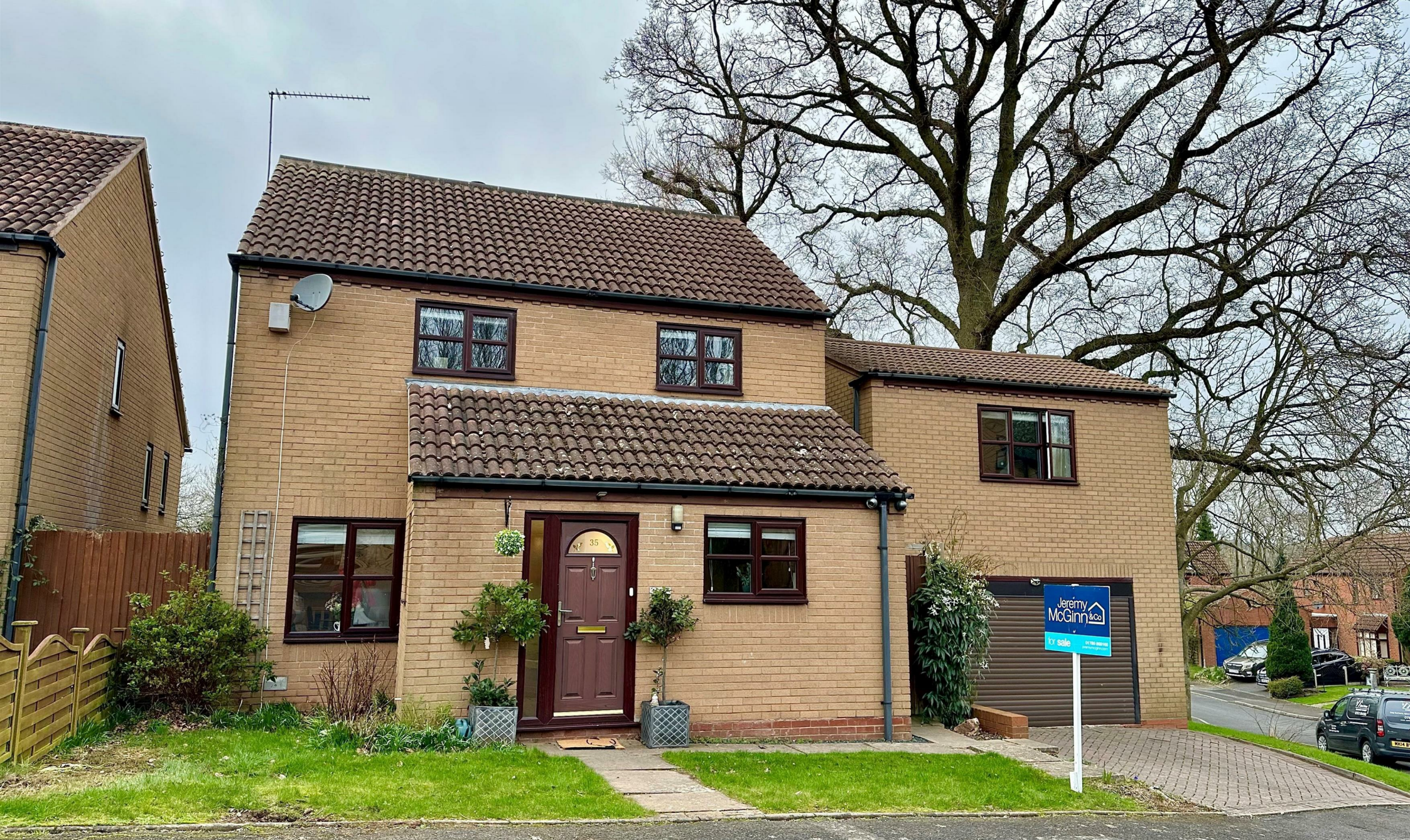
Brookfield Close , Hunt End Redditch, B97 5LL