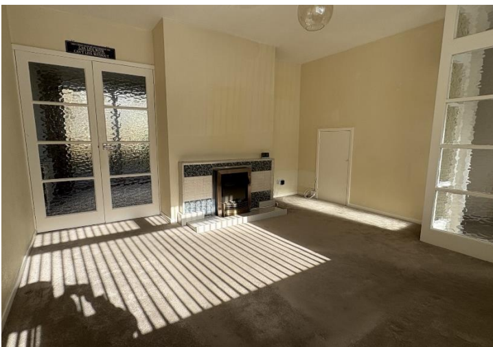
Lounge front: Spacious room with central heating radiator and double glazed window to the front.