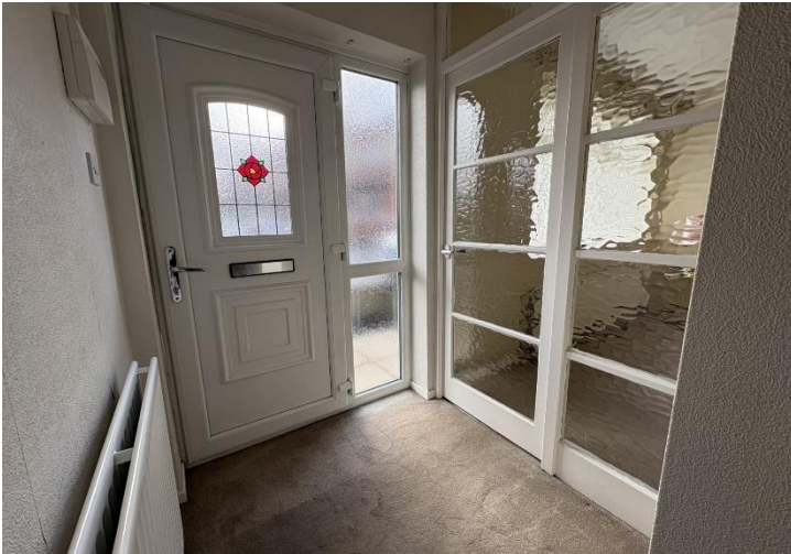
Entrance: Double glazed front door opening in to the entrance hall.