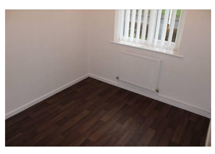
Bedroom two front: 8′2 x 8′4 With central heating radiator and double glazed window to the front.

Bathroom/wc: 5′5 x 8′4 With three piece suite in white, shower mixer taps, splashback tiling, central heating radiator and double glazed window to the side.