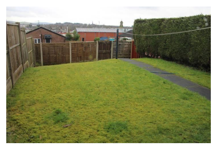
Outside: To the rear there is a generous, enclosed, private garden area with law, conifers and boundary fencing whilst to the front there is a small garden forecourt with lawn and boundary walls.