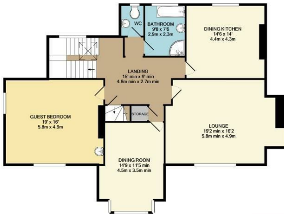
FIRST FLOOR APPROX. FLOOR AREA 1381 SQ.FT. (128.3 SQ.M.)