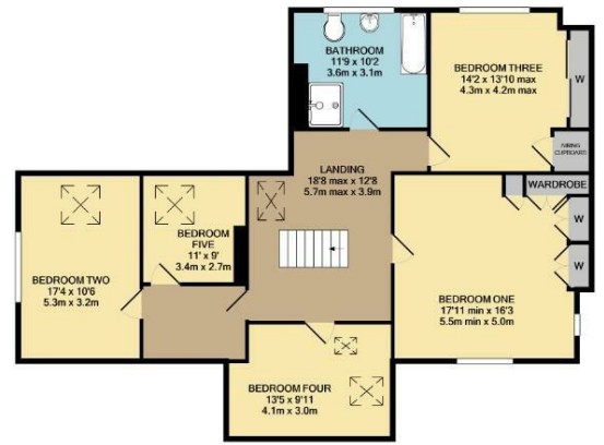
SECOND FLOOR APPROX. FLOOR AREA 1028 SQ.FT. (112.3 SQ.M.)