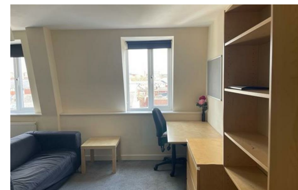
Studio 201 Burton Chambers, 2 Dale Road, Selly Oak, Birmingham, £790 PCM