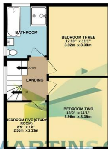
1ST FLOOR 481 sq.ft. (44.7 sq.m.) approx.