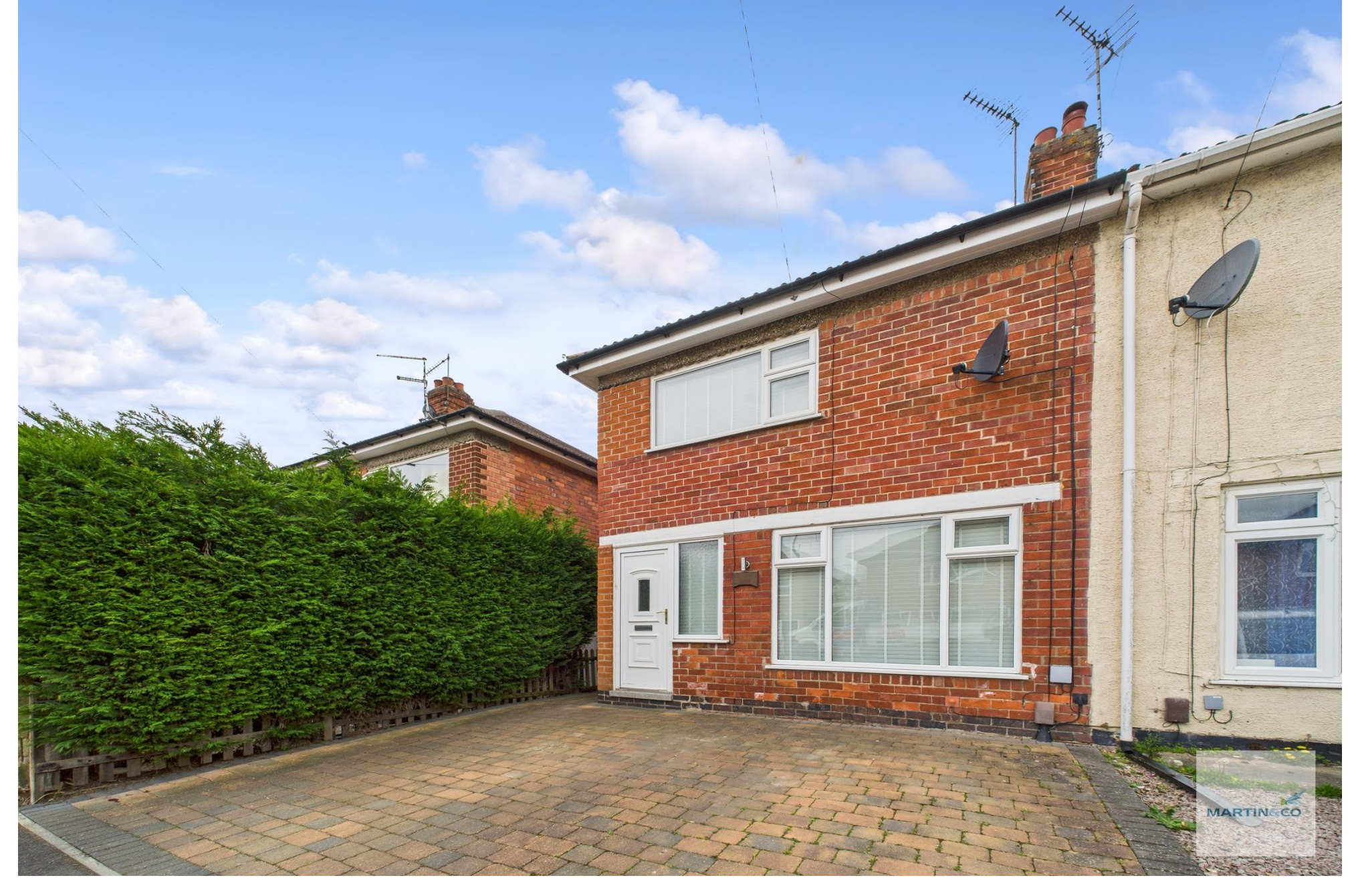
Mottram Road, Beeston, Nottingham, NG9 4FW Guide Price £250,000-£260,000 Freehold