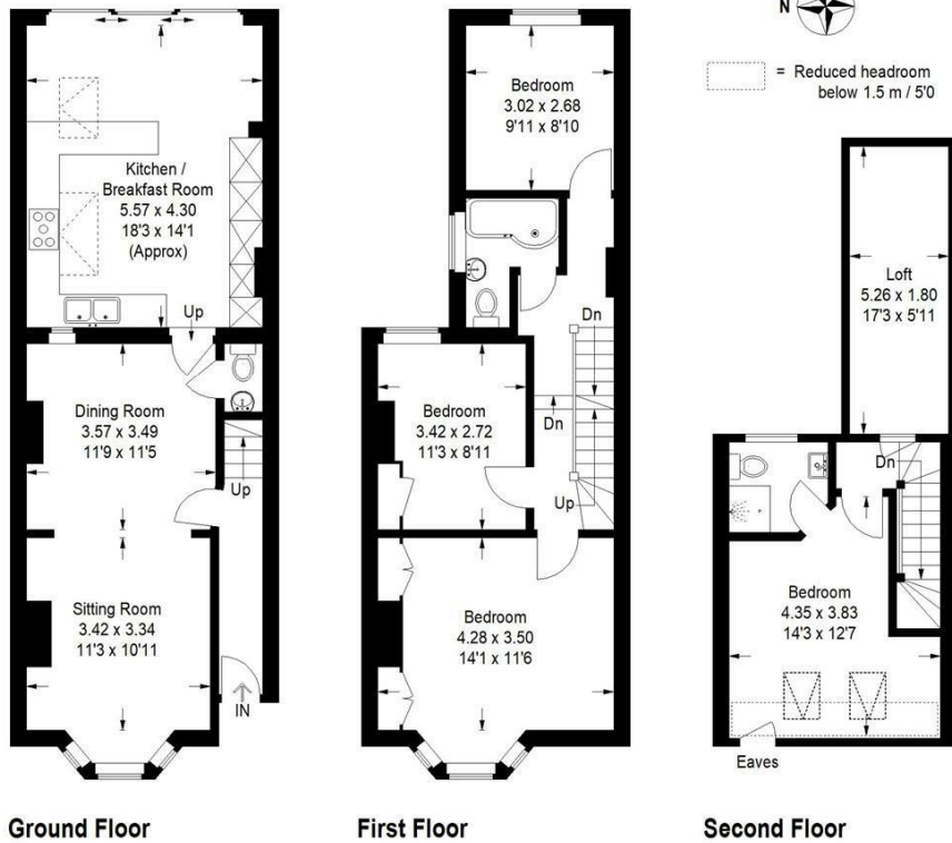
Illustration for identification purposes only, measurements are approximate, not to scale. Imageplansurveys @ 2024

Approximate Gross Internal Area (Including Reduced Headroom / Loft) 133.6 sq m / 1438 sq ft