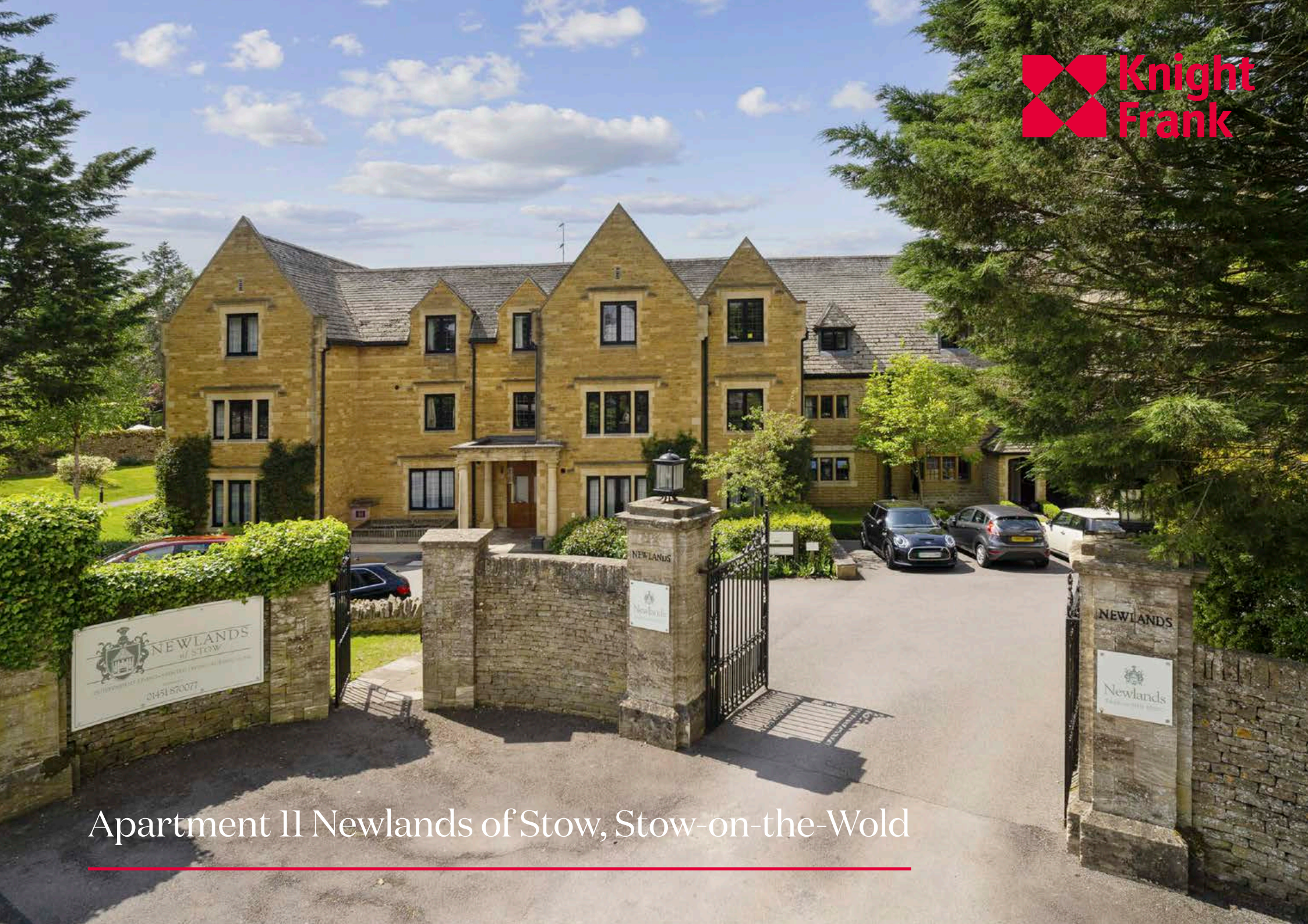
Apartment 11 Newlands of Stow, Stow-on-the-Wold