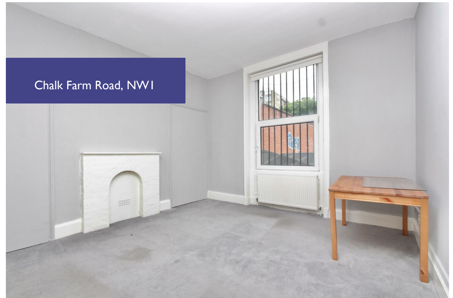
Chalk Farm Road, NW1

The Floor plan is not to scale and measurements and areas shown are approximate and therefore should be used for illustrative purposes only. The plan has been prepared in accordance with the RICS code of Measuring Practice and whilst we have confidence in the information produced it must not be relied on. If there is any aspect of particular importance, you should carry out or commission your own inspection of the property. Copyright @ BLEUPLAN