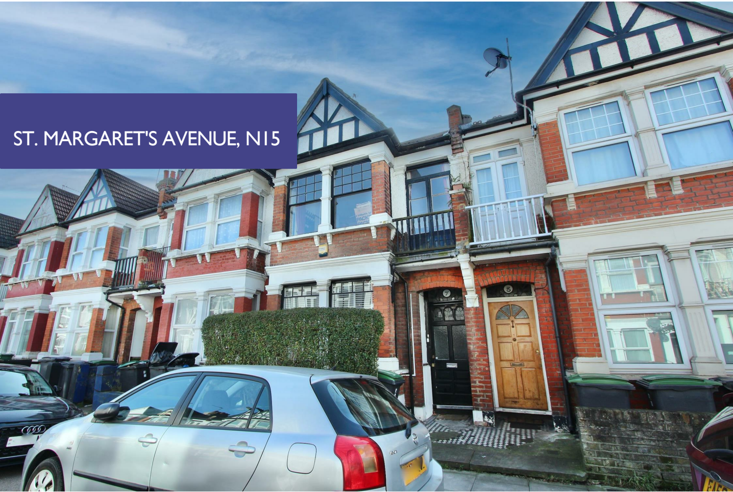
ST. MARGARET'S AVENUE, N15