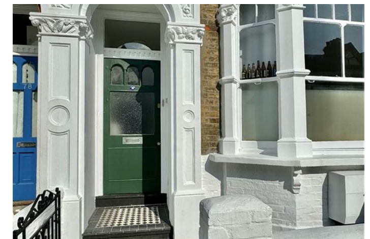
FLAT - CONVERSION (EPC RATING: D)

76A PRINCESS MAY ROAD, STOKE NEWINGTON, LONDON, N16 8DG