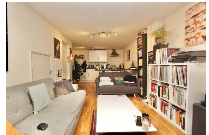
HOUSE (EPC RATING: C)