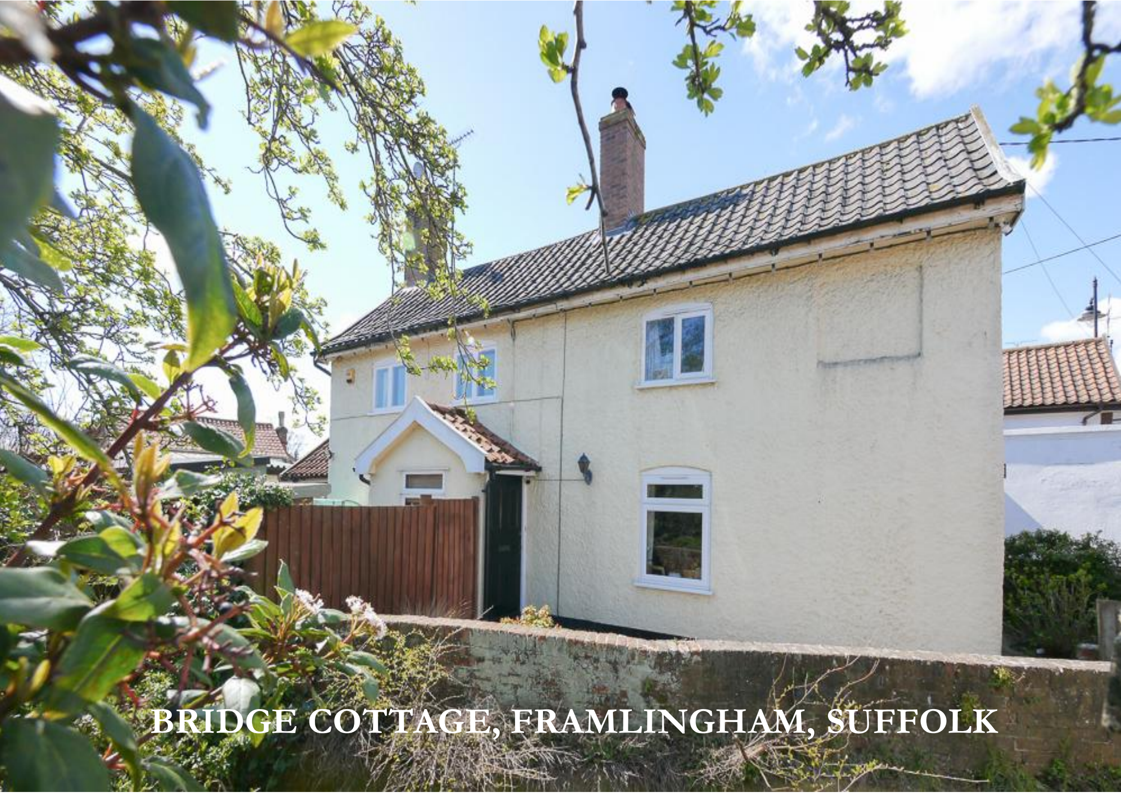
BRIDGE COTTAGE, FRAMLINGHAM, SUFFOLK