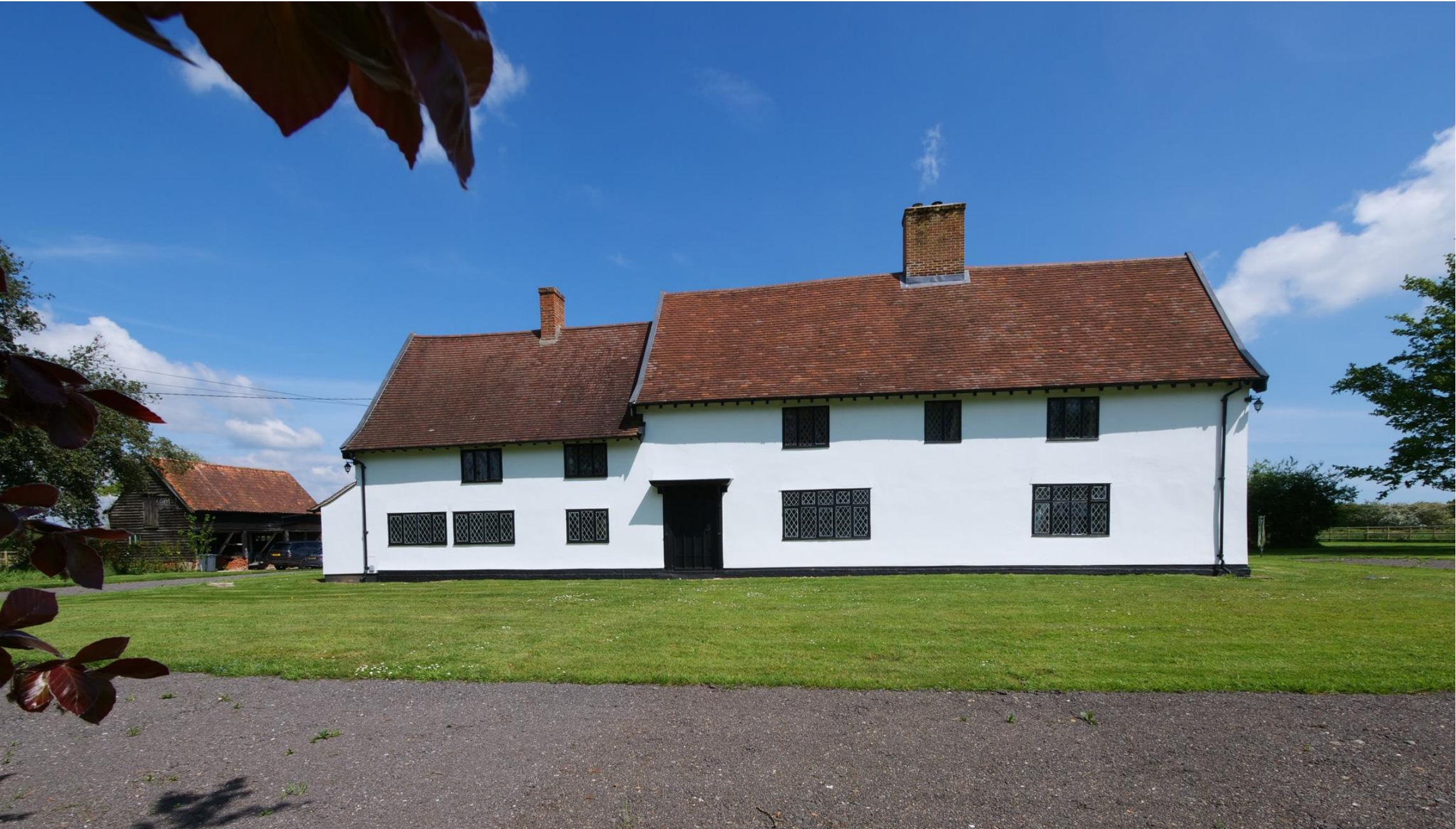
North Green Farmhouse