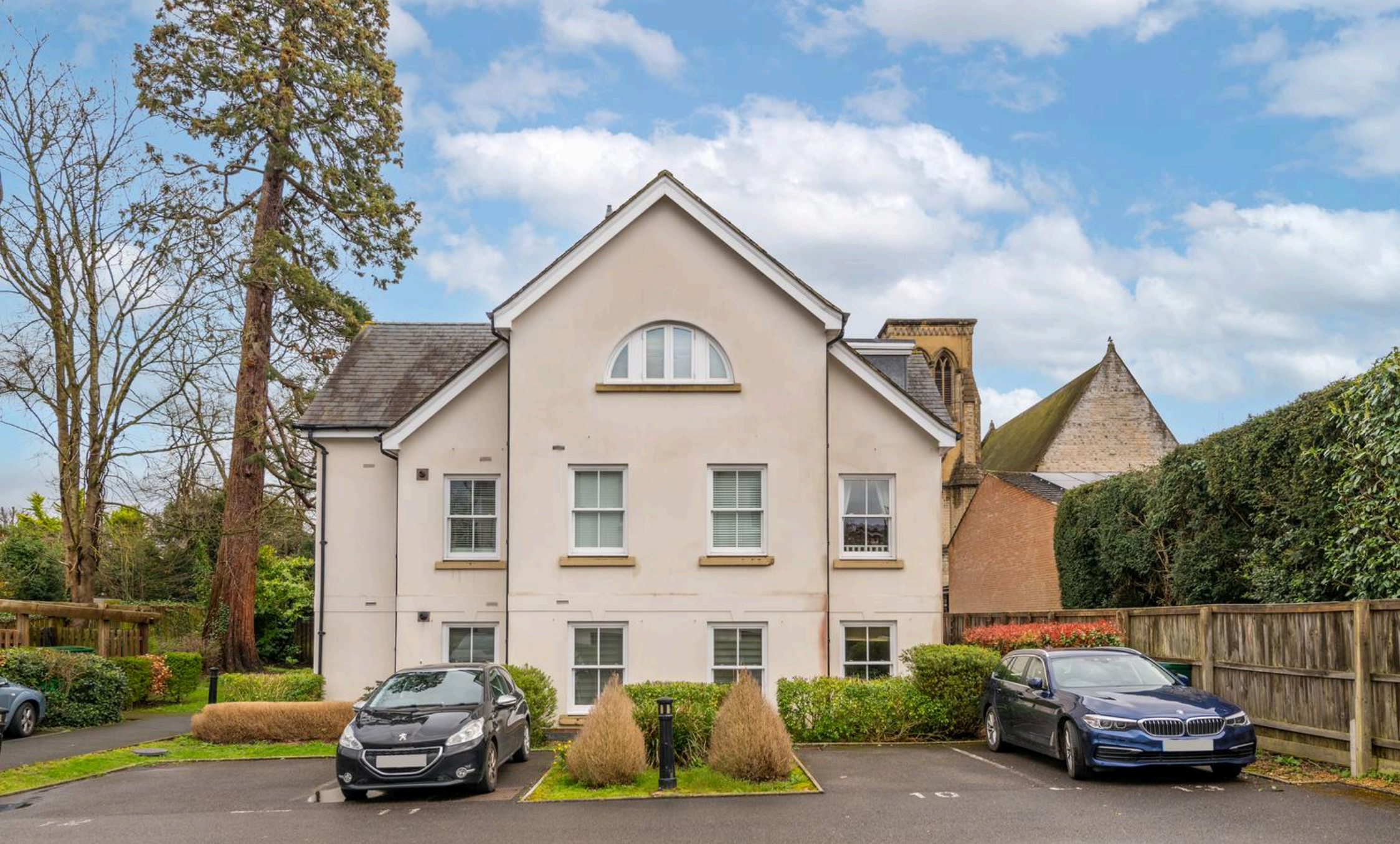
Flat 17, Wellingtonia Place, 42 Reigate Hill Reigate