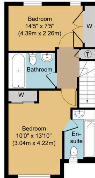
First Floor Approximate Floor Area 379 sq. ft (35.20 sq. m)