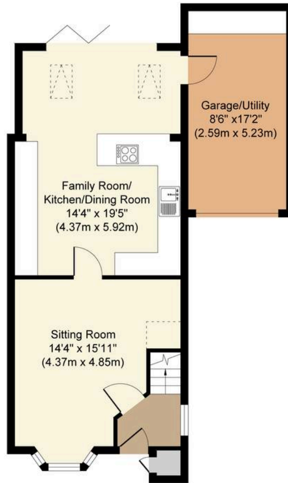
Ground Floor Approximate Floor Area 657 sq. ft (61.00 sq. m)