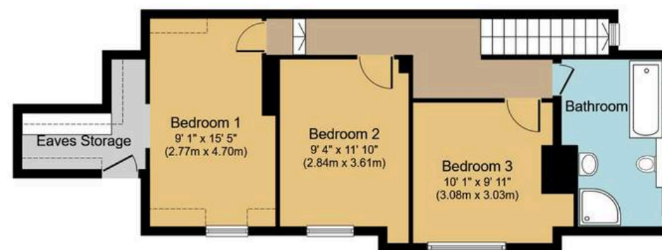
First Floor Approximate Floor Area 623 sq. ft. (57.9 sq. m.)