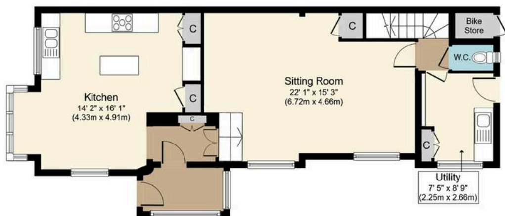
Ground Floor Approximate Floor Area 788 sq. ft. (73.2 sq. m.)