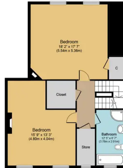
Second Floor Approximate Floor Area 947 sq.ft. (88.0 sq.m.)