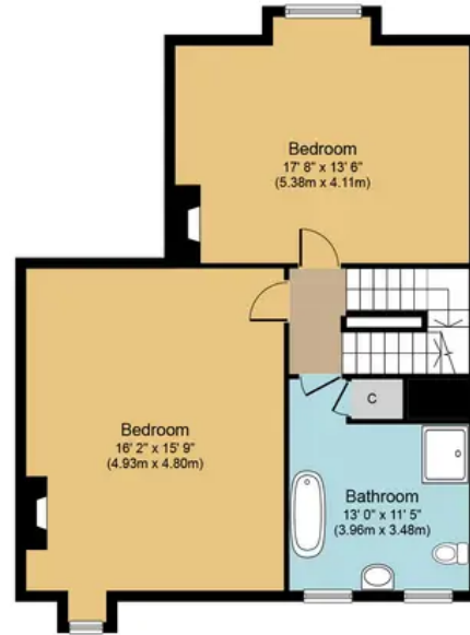
First Floor Approximate Floor Area 818 sq.ft. (76.9 sq.m.)