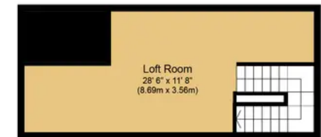
Loft Floor Approximate Floor Area 339 sq.ft. (51.5 sq.m.)

Gatton Road, RH2 Approx. Gross Internal Floor Area 3,015 q.ft. (281.0 sq.m.) Loft Floor Area 339 q.ft. (51.5 sq.m.)