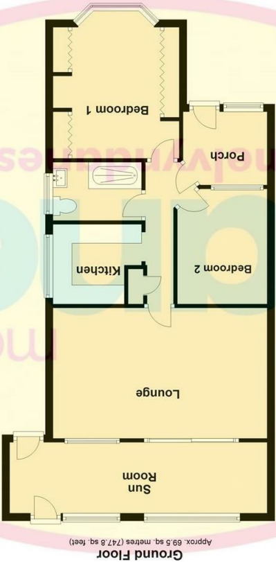
Total area: approx. 69.5 sq. metres (747.8 sq. feet)

121 Elmay Road Sheldon Birmingham B26 2QU Council Tax Band: C