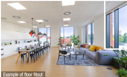
Example of floor fitout

Now part of the Ashford Commercial Quarter, this landmark building offers modern office space in the heart of the town.