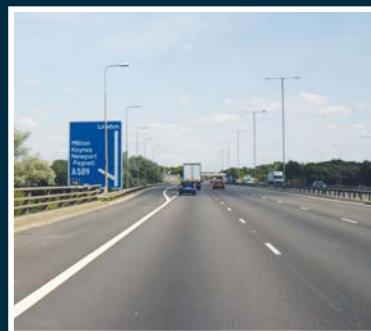
5 mins to M1 (J14)