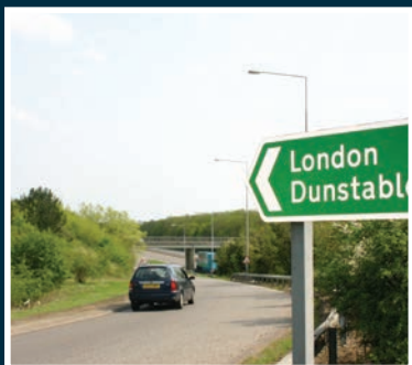
Immediate access to A5

For further information or to arrange a viewing, please call: