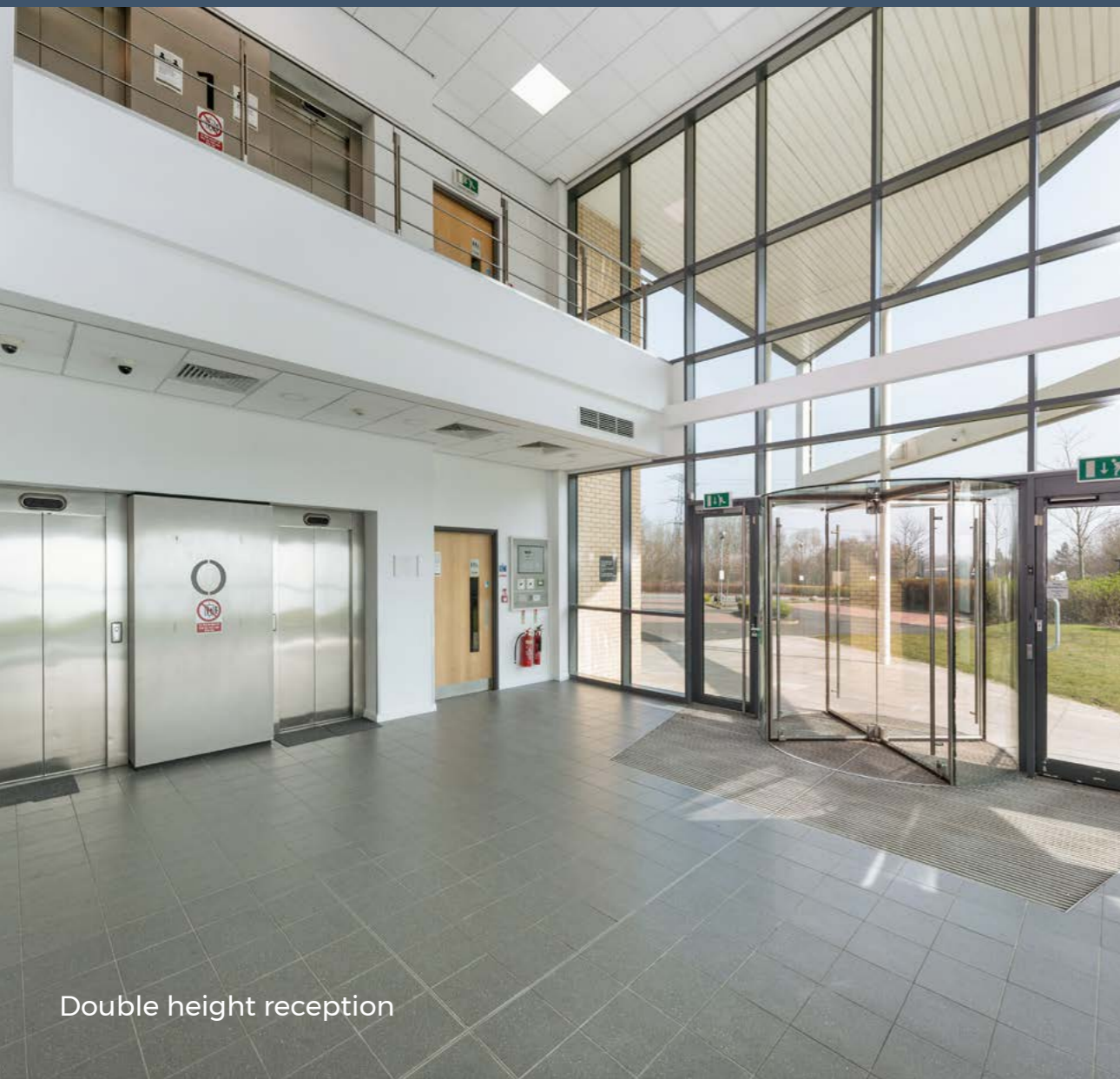
Double height reception