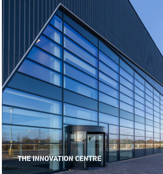
THE INNOVATION CENTRE

1 MILLION SQ FT OF FLEXIBLE BUILDING OPPORTUNITIES