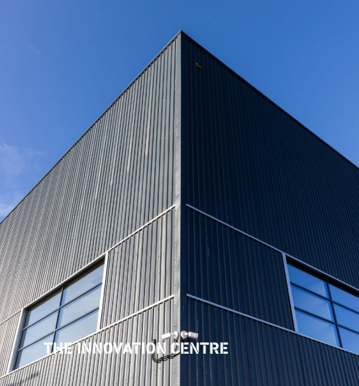
THE INNOVATION CENTRE

623,000 SQ FT HAS BEEN DEVELOPED ACROSS THREE BUILDINGS