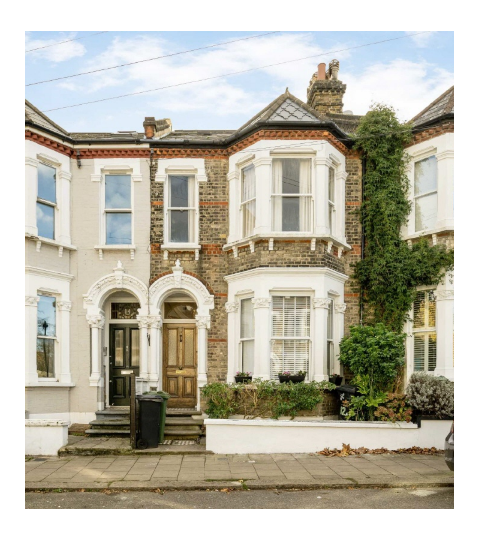
Cotherstone Road, SW2 £550,000