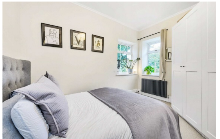
Madeira Road, SW16