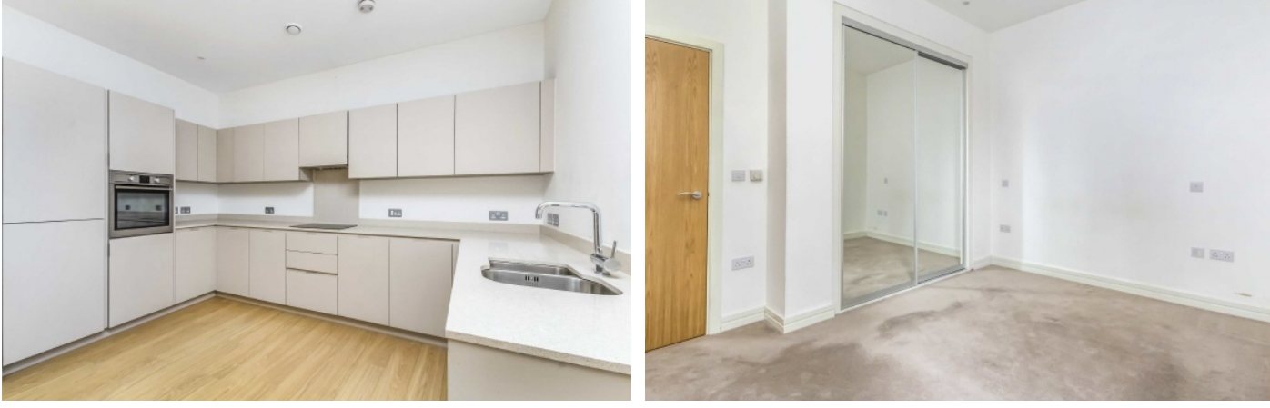
Cherry Orchard Road, CR0