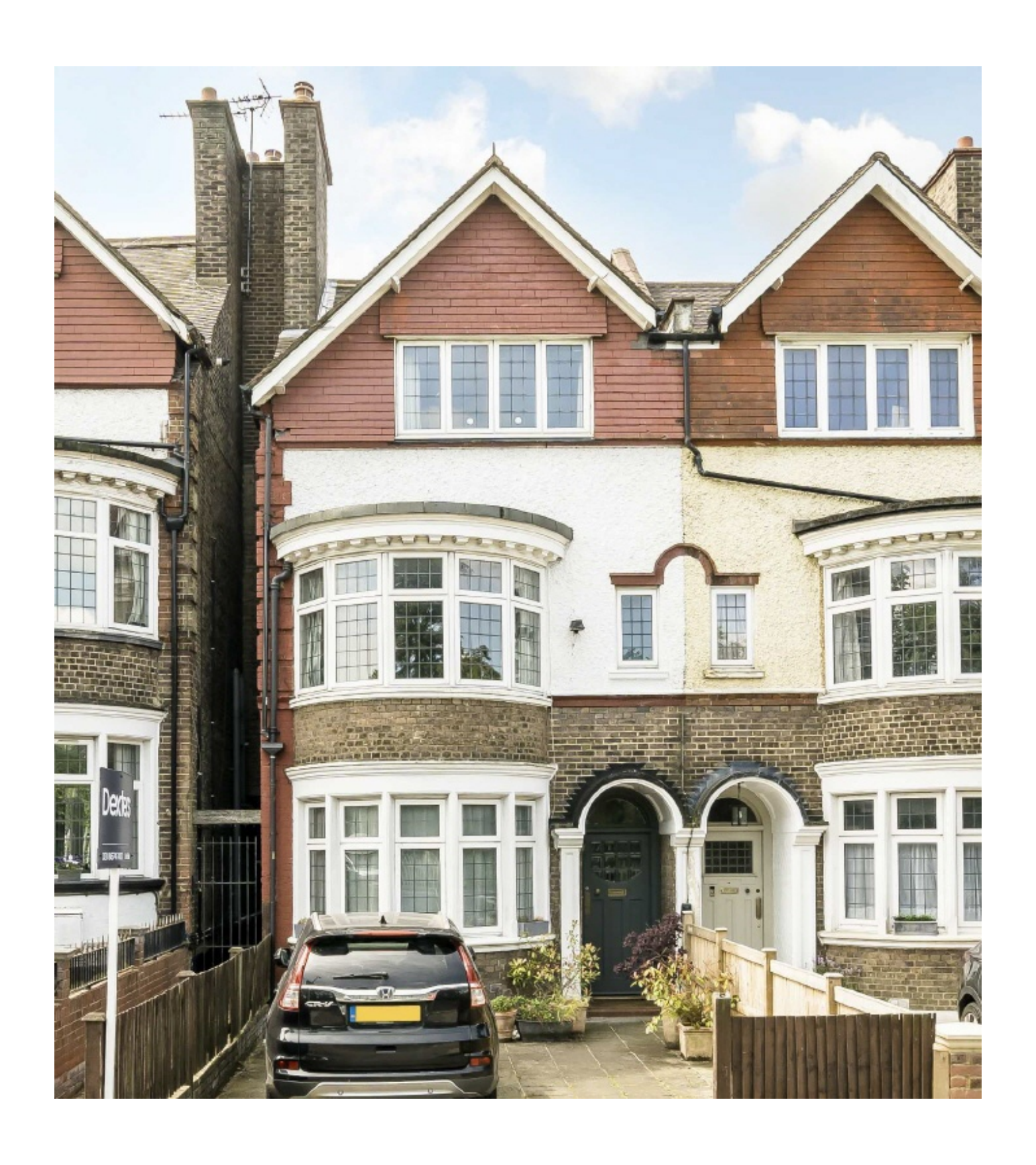
Drewstead Road, SW16 £1,550,000