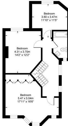
First Floor Approximate Floor Area 665.30 sq.ft (61.80 sq.m)