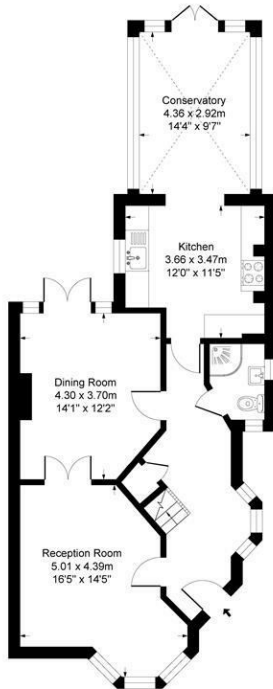
Ground Floor Approximate Floor Area 804.25 sq.ft (74.71 sq.m)

Approx. Gross Internal Floor Area 186.1 Sq M - 2004 Sq Ft