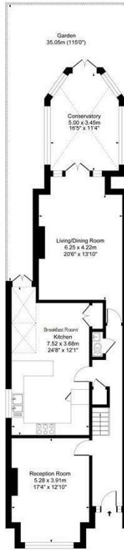
Ground Floor Approximate Floor Area 1156.08 sq ft (107.47 sq m)

St Mary's Crescent TW7 Approx. Gross Area: 2099 sq ft 194.0 Sq M - 2099 Sq Ft