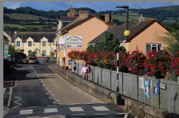
Please note: All images above depict the surrounding area.