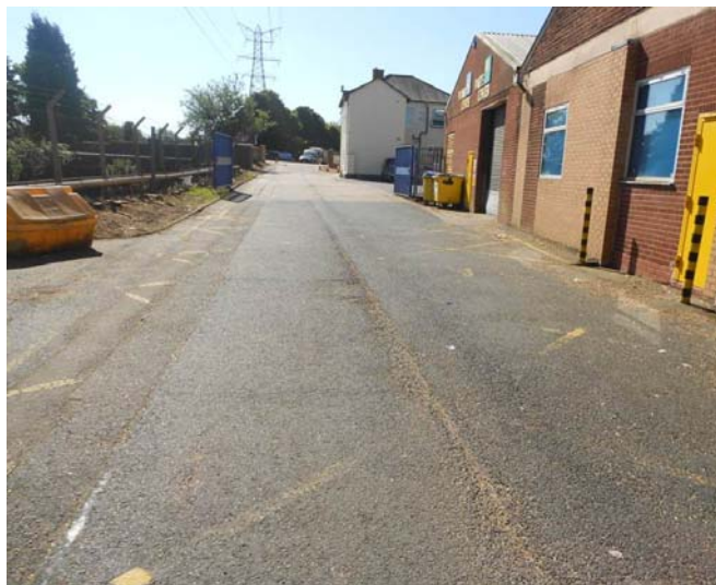
Main Entrance Driveway