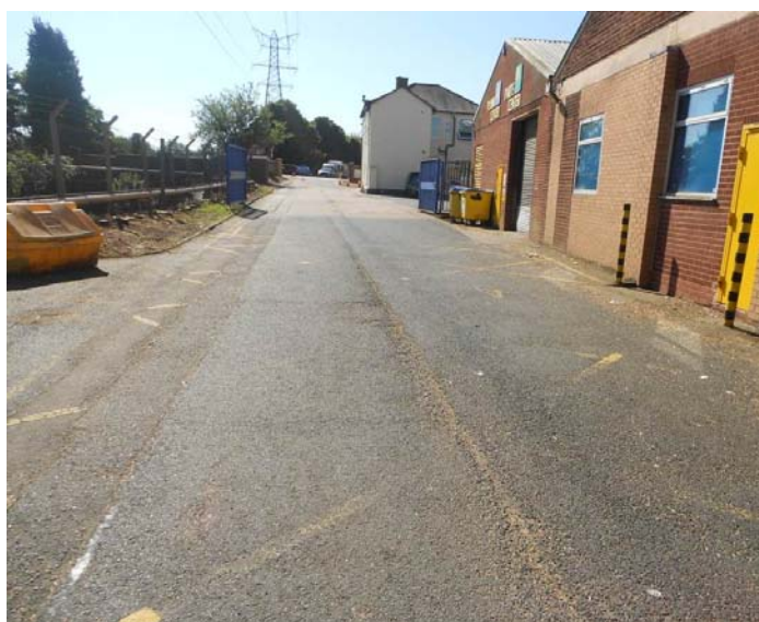
Main Entrance Driveway